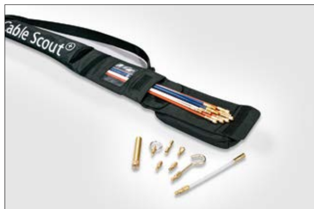
All components stored neat and tidy with the Cable Scout+ Deluxe set.