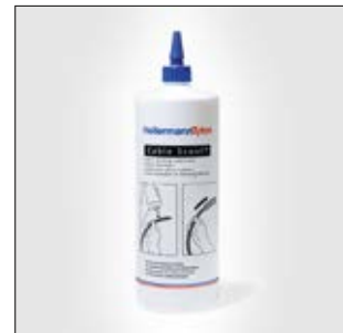
Cable Pulling Lubricant reduces friction during the installation of cables.