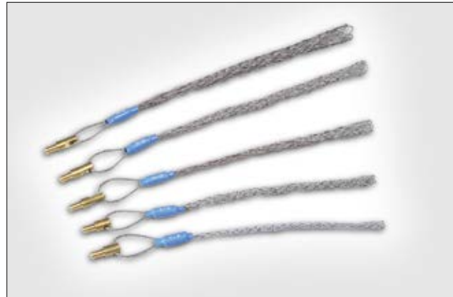
Cable Grips are available in five different sizes to attach a wide range of cable diameters.