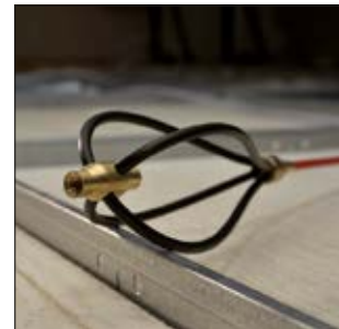
The whisk allows the rod to glide over obstructions easily.