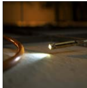
The Cable Scout+ Beam - a perfect tool for seeing into cavities.