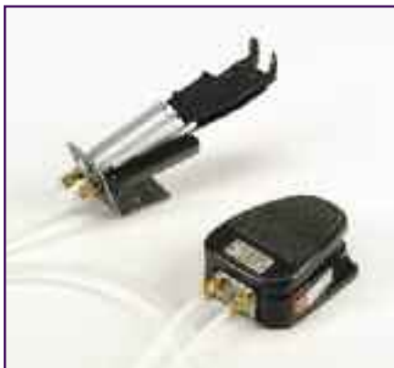
Part No. OT02 Bench Mount Kit shown installed with Heyco Air Tool

*Jaw part number if purchased separately. See drawing below.