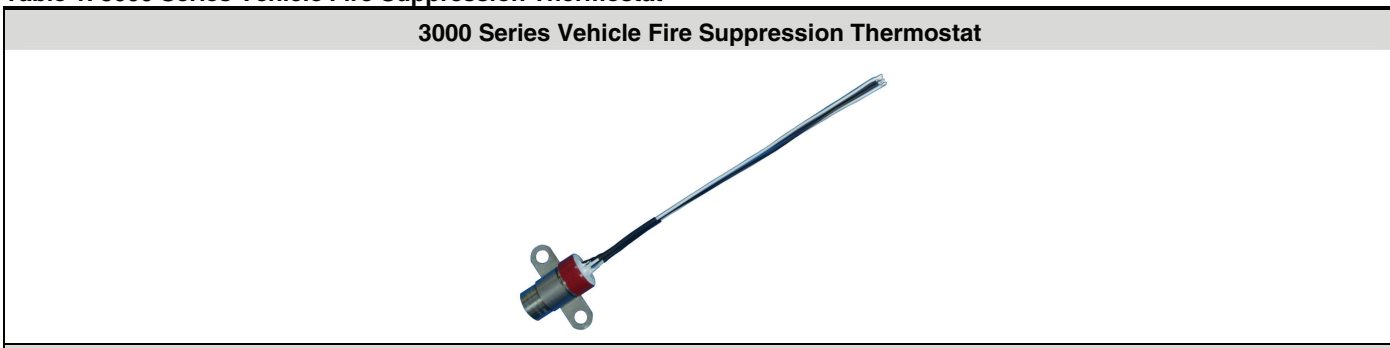
Table 1. 3000 Series Vehicle Fire Suppression Thermostat

At least one thermostat is installed in each protected area of the vehicle (see Figure 1). The four-conductor configuration allows continuous integrity monitoring of all circuits connecting the thermostats.