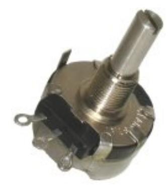
Representative photograph, actual product appearance may vary.

Due to regional agency approval requirements, some products may not be available in your area. Please contact your regional Honeywell office regarding your product of choice.