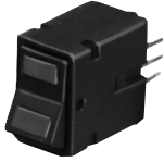
PWB Mount (Lighted rocker)