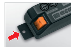
MOUNTING BRACKETS INCLUDED

The manufacturer reserves the right to change the technical parameters of the device, resulting from technological progress. ATTENTION! The technical data define the maximum values of surges against which the device protects.