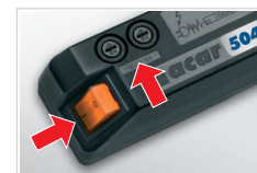
ILLUMINATED DOUBLE POLE MAINS SWITCH AND 2 FUSES