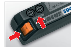
ILLUMINATED DOUBLE POLE MAINS SWITCH AND 2 FUSES