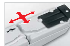
4 POSSIBLE DIRECTIONS OF ARRANGEMENT OF THE POWER CABLE

The manufacturer reserves the right to change the technical parameters of the device, resulting from technological progress. ATTENTION! The technical data define the maximum values of surges against which the device protects.