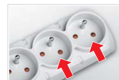
5 SOCKETS 10A WITH EARTHING PIN AND SAFETY SHUTTERS