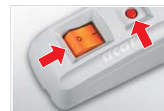
ILLUMINATED DOUBLE POLE MAINS SWITCH AND SLOW-BLOW AUTOMATIC FUSE