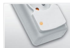
SURGE PROTECTION INDICATOR

The manufacturer reserves the right to change the technical parameters of the device, resulting from technological progress. ATTENTION! The technical data define the maximum values of surges against which the device protects.