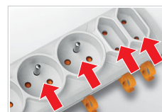
5 SOCKET OUTLETS 10A WITH EARTHING PIN, 2 UNEARTHED EURO SOCKETS, ALL OF THEM WITH SAFETY SHUTTERS