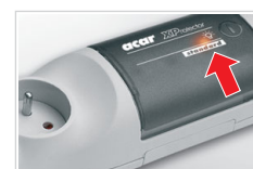
DOUBLE POLE, INTEGRATED MAINS SWITCH WITH POWER ON INDICATOR