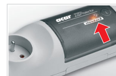
DOUBLE POLE, INTEGRATED MAINS SWITCH WITH POWER ON INDICATOR