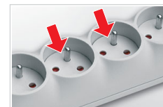
5 SOCKET OUTLETS 10A WITH EARTHING PIN AND SAFETY SHUTTERS