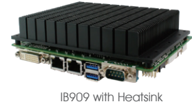
IB909 with Heatsink