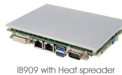
IB909 with Heat spreader