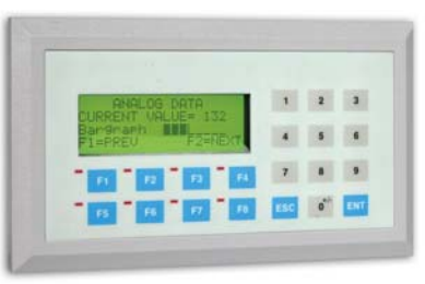
4 Line Display