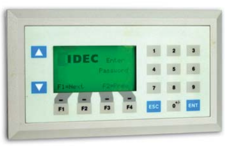
8 Line Display