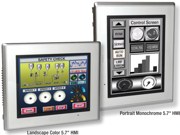
Landscape Color 5.7" HMI