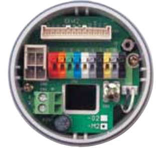
Color Coded Wiring Terminals

*Alarm 1: continuous sound *Alarm 2: intermittent sound