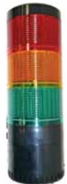
Short body type