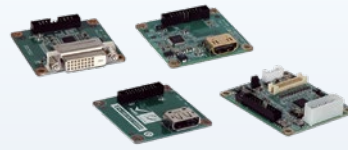
iDP converter cards with brackets