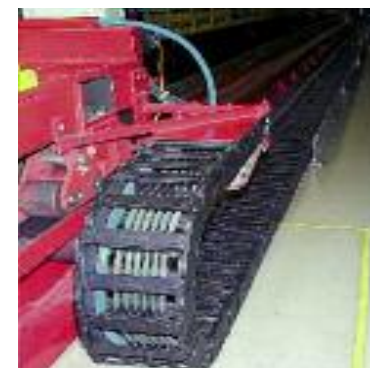
chainflex® CF5/CF6 for shelf control units: long travel in the longitudinal axis. e-chain®: Serie E4/00 with igus® guide trough out of steel

G = with green-yellow earth core x = without earth core