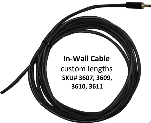
In-Wall Cable custom lengths SKU# 3607, 3609, 3610, 3611

Inspired LED's unique line of Interconnect Accessories are compatible with 3.5mm x 1.3mm DC input/output jacks. Cables are available in standard or custom lengths, and all interconnect products combine easily with Inspired LED flex strips and LED panels to create the perfect low-voltage lighting system for any location.