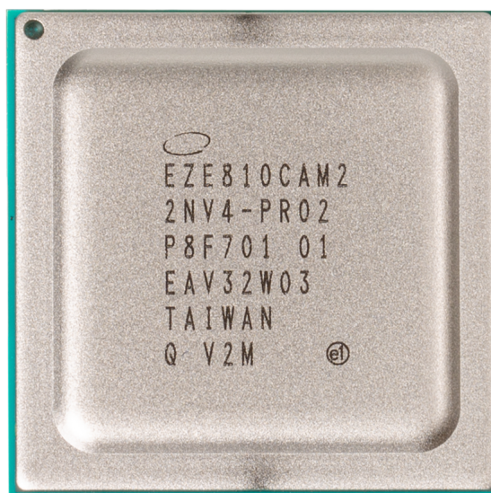
Figure 1-1. Example Component with Identifying Marks