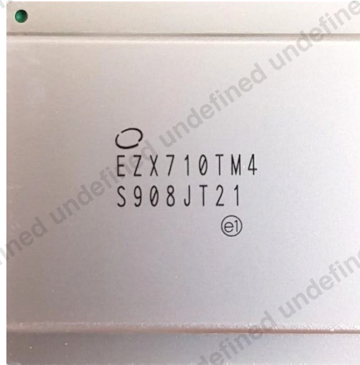
Figure 1-1. Example Component with Identifying Marks