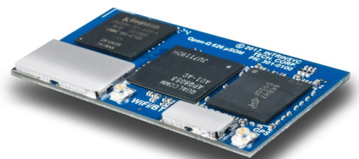
Open-Q 626 μSOM