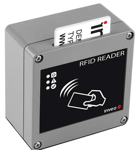
RFID IND-Modbus Slot housing option with card slot