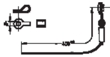
VG95234 Style KC with cord

for plugs, shell style 3106 and 3108 Material: Aluminum alloy