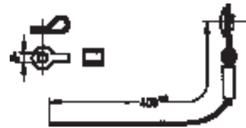
VG95234 Style KA with cord

for receptacles, shell style 3100, 3101 und 3102 Material: Aluminum alloy