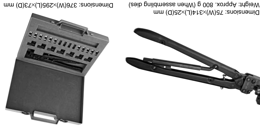
Dimensions: 75(W)×314(L)×25(D) mm Weight: Approx. 800 g (When assembling dies)

Note: 1. J1000 Finish(*): T..... Tin-plated GC..... Gold-plated GF..... Nickel-undercoated, 0.38µm selective gold-plated 2. J300 Finish(*): GF..... Nickel-undercoated, 0.76µm selective gold-plated T..... Tin-plated 3. The wear of parts is caused by using hand tool repeatedly. Measure the crimping height daily and conduct periodical inspection of the wearing parts, such as ratchet, pin and so on.