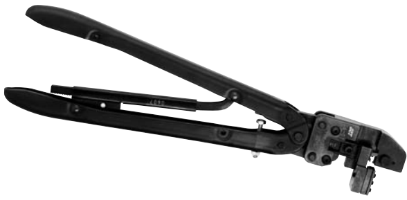
Dimensions: 75(W)×314(L)×25(D) mm Weight: Approx. 800 g (When assembling dies)