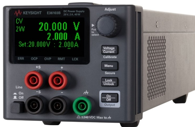
Option J01 recessed binding posts

Do you need to convert the power supply for different mains power? The two switches on the bottom of the instrument make it straightforward. See the product manual for details.