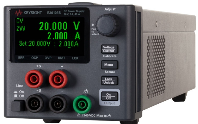
Option J01 recessed binding posts