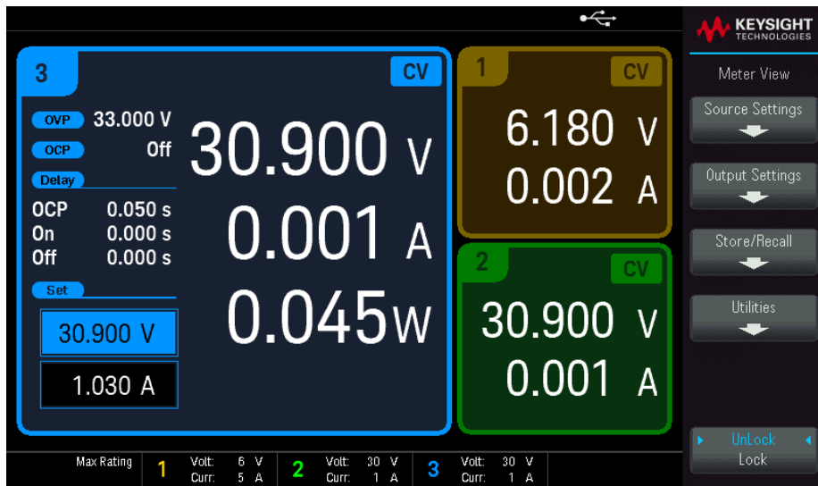
Figure 2. View details of a single channel including the measured power, OVP/OCP condition, and delays.

Figure 2 shows the single-channel view that includes the measured power, OVP / OCP condition, and delays. You can also monitor the readback, voltage and current for the other two channels.