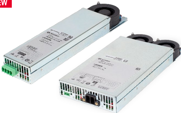
Figure 6a. The Electronic Load Series