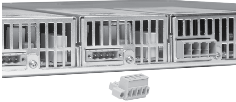
Figure 5. Quick disconnects for power and sense leads