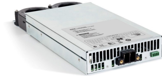
Figure 6c The N6753A – N6756A High performance and the N6763A – N6766A Precision DC power modules each occupy two module slots within the mainframe. All other modules occupy 1 module slot.

For details on these products and how they can be used for applications including battery drain analysis and function test, visit www.keysight.com/find/N6780 and download the N6780 Series Source/Measure Units (SMUs) for the N6700 Modular Power System Data Sheet , literature number 5990-5829EN