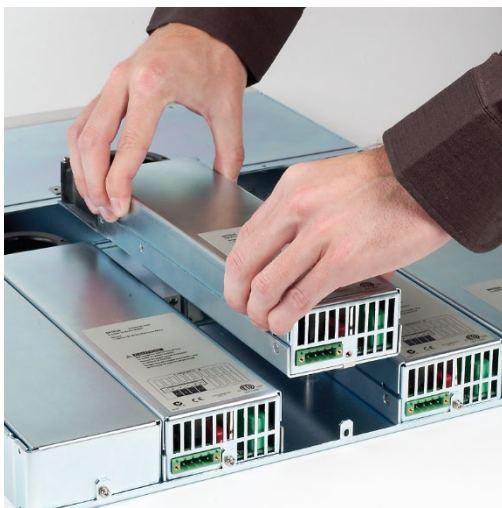
Figure 6c. User re-configurable modular system

For details on these products and how they can be used for specific applications visit www.keysight.com/find/N6783A-BAT , www.keysight.com/find/N6783A-MFG and download the N6783A-BAT Data Sheet , 5990-8662EN and the N6783A-MFG Data Sheet , 5990-8643EN.