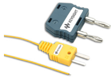
U1186A K-type Thermocouple and Adapter