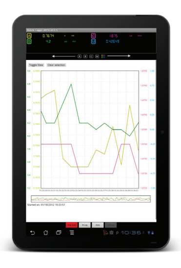
Figure 4. Data logging with Keysight Mobile Logger software.