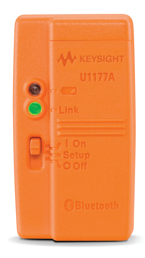
Figure 3. The U1177A as illustrated