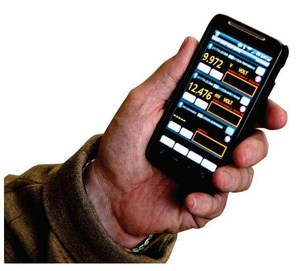
Figure 6. Make measurements with the Keysight Mobile Meter via an Android smart phone

Keysight Mobile Meter is a free Android application software that allows an Android device to connect, control and perform up to 3 multimeter measurements. Without the need to be physically present at various points, users can now extend their reach to two or three places. This solution allows you to make measurements from a safe distance, eliminates the need to walk back-and-forth between measure target and control points, and monitors multiple measurements simultaneously. Achieve higher work productivity when you use the U1177A with your Keysight handheld digital multimeters.