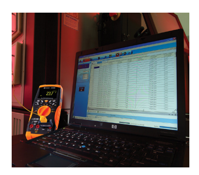
Figure 1. Automate recording of measurements with bundled GUI data-logging software.