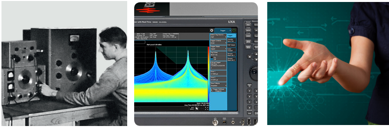
From Hewlett-Packard to Agilent to Keysight

Our unique combination of hardware, software, support, and people can help you reach your next breakthrough. We are unlocking the future of technology.