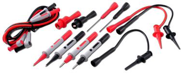
U1168A standard test lead kit

Includes two test leads (red and black), 19-mm and 4-mm test probes, alligator clips, fine-tip test probes, SMT grabbers and mini grabber (black).