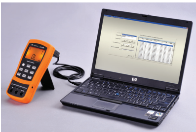
Figure 1. Automate the recording of continuous readings when you hook the U1701B to a PC

With up to 25 sets of High/Low limits that you can store and choose from in compare mode, the U1701B lets you breeze through capacitor sorting without the need to set and reset the standard reference for different capacitors-under-test.