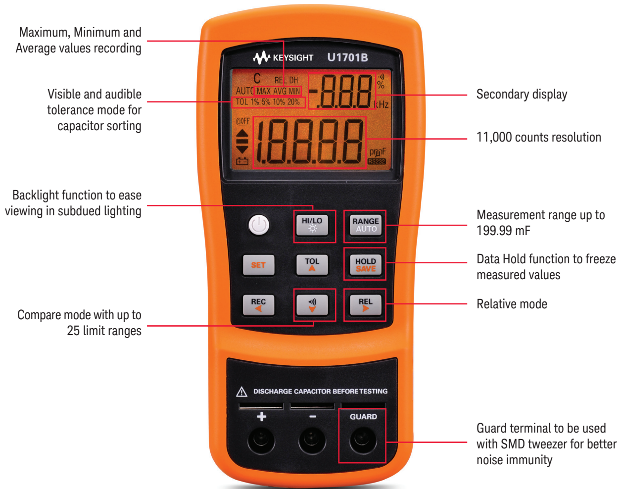
Figure 2. U1701B front view