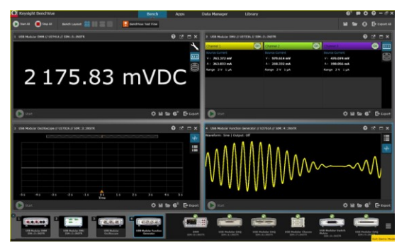
Figure 1. View measurements across USB DAQ, modular, and bench instruments all on one BenchVue interface.

The USB Modular DAQ App within BenchVue allows you to quickly configure and control any USB DAQ devices to perform data logging and visualize measurements. With six different display options, including grids and strip charts, zooming in to details the way you want is so much easier — so you can nail that measurement error in no time. You can also record measurements and export results to popular PC-friendly applications such as Microsoft Excel and Microsoft Word for further analysis in just a few clicks.