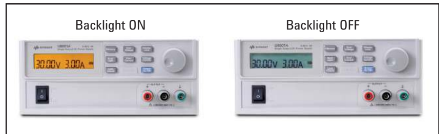
Figure 2. Backlight on/off options for LCD display