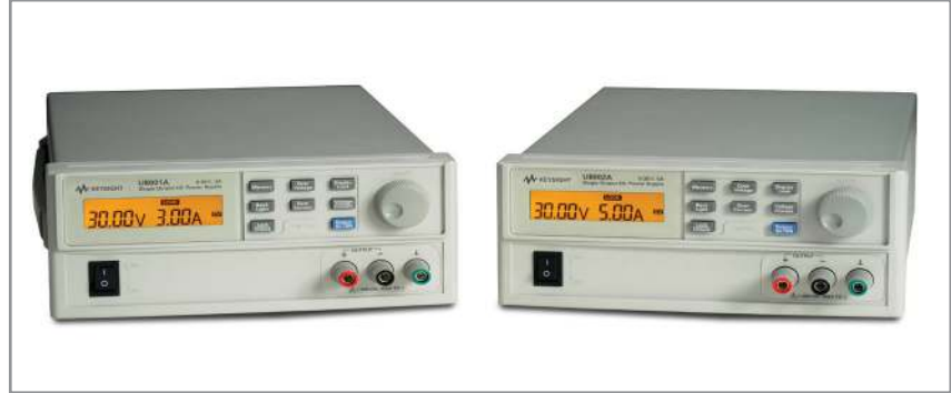
Figure 1. The U8001A 90 W and U8002A 150 W single output DC power supplies