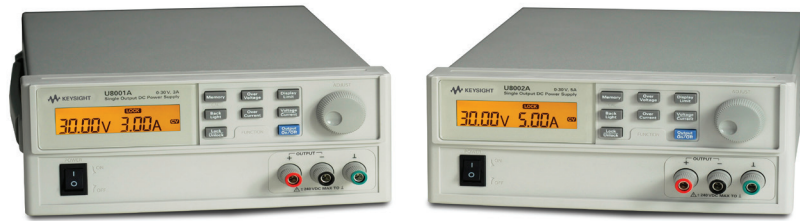
Figure 1. The U8001A 90 W and U8002A 150 W single output DC power supplies