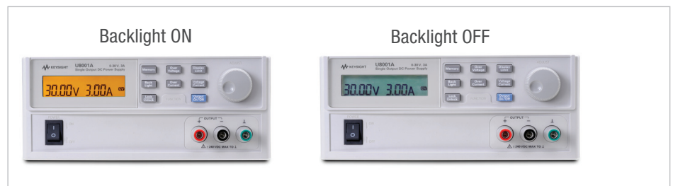
Figure 2. Backlight on/off options for LCD display