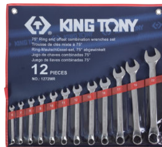
► MR / SR : Nylon pouch bag