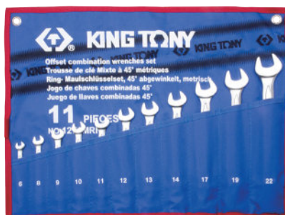
► MRN / SRN : Teton pouch bag