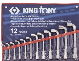
► MR / SR : Nylon pouch bag