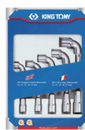
► Color box