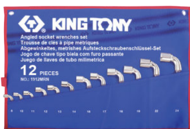
► MRN / SRN : Teton pouch bag