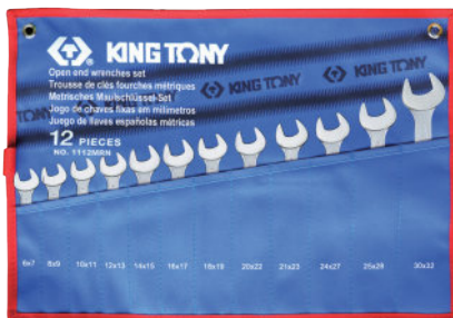
► MRN / SRN : Teton pouch bag