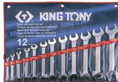
► MR / SR : Nylon pouch bag