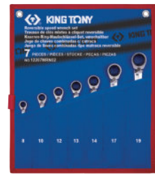
► Teton pouch bag