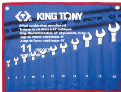
► MRN / SRN : Teton pouch bag