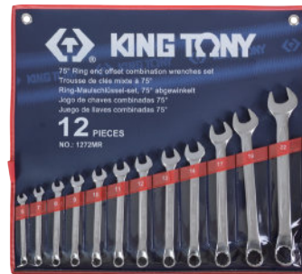
► MR / SR : Nylon pouch bag