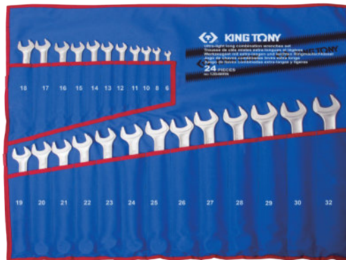
► Pouch material : Tetoron