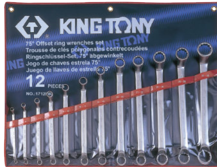
► MR / SR : Nylon pouch bag