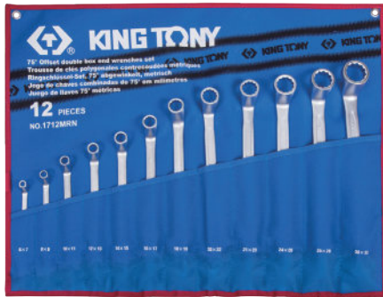
► MRN / SRN : Teton pouch bag