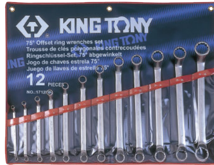
► MR / SR : Nylon pouch bag