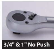
3/4" & 1" No Push