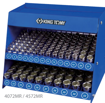
4072MR / 4572MR

Metal shelf size (mm) : 415x 336 x 320 (1.58 cuft)