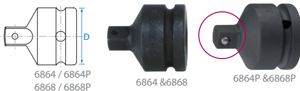
6864 / 6864P 6868 / 6868P