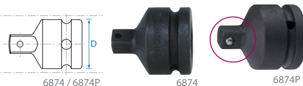
6874 / 6874P