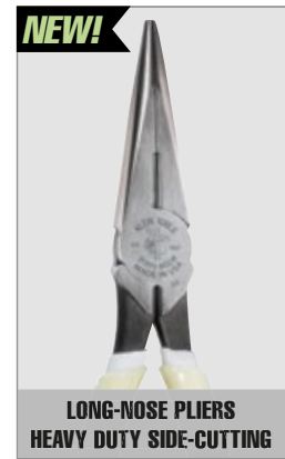
LONG-NOSE PLIERS HEAVY DUTY SIDE-CUTTING