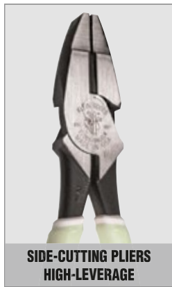
SIDE-CUTTING PLIERS HIGH-LEVERAGE

to easily locate your tool in dark or low lit areas.