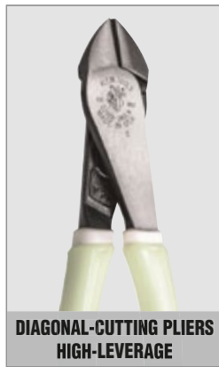
DIAGONAL-CUTTING PLIERS HIGH-LEVERAGE